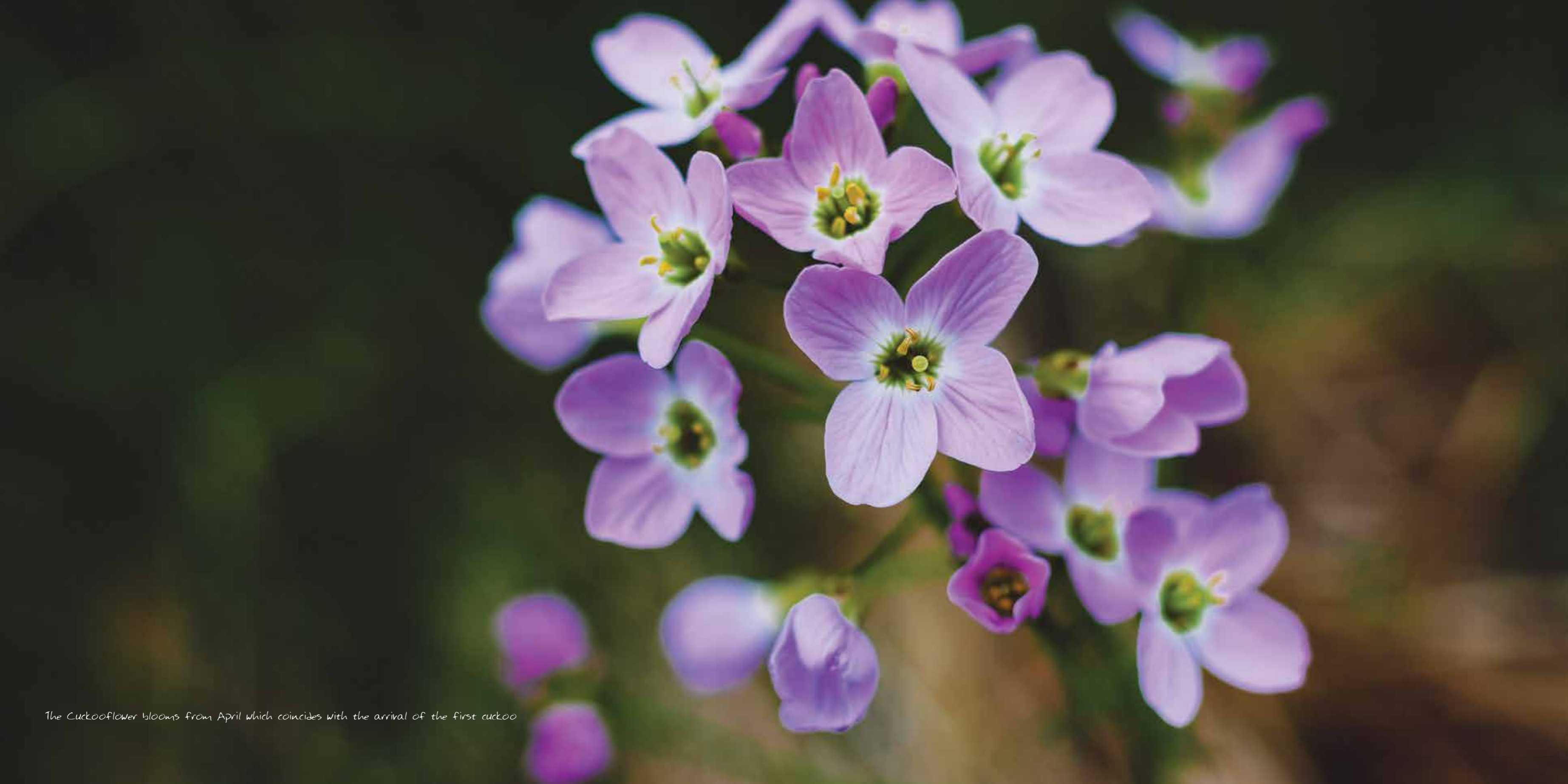
The Cuckooflower blooms from April which coincides with the arrival of the first cuckoo