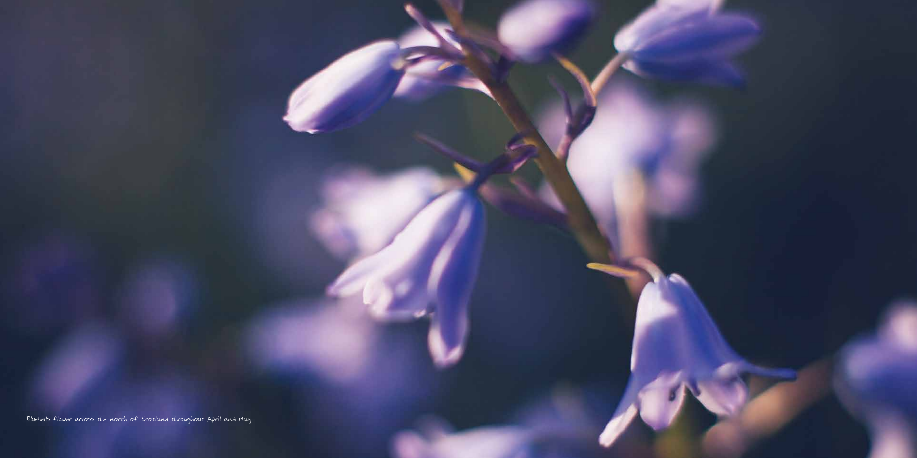
Bluebells flower across the north of Scotland throughout April and May