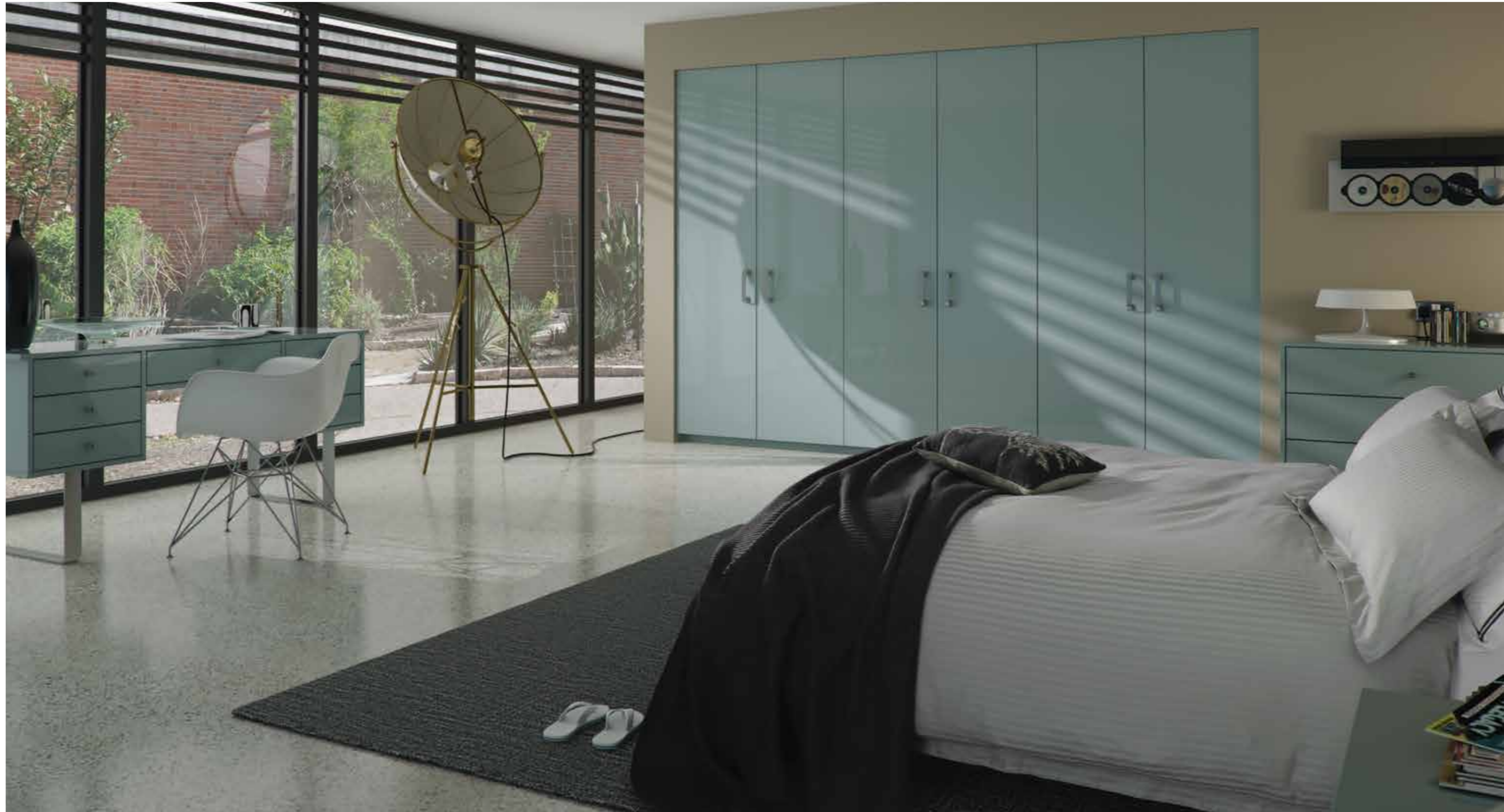
Ophelia Metallic Blue