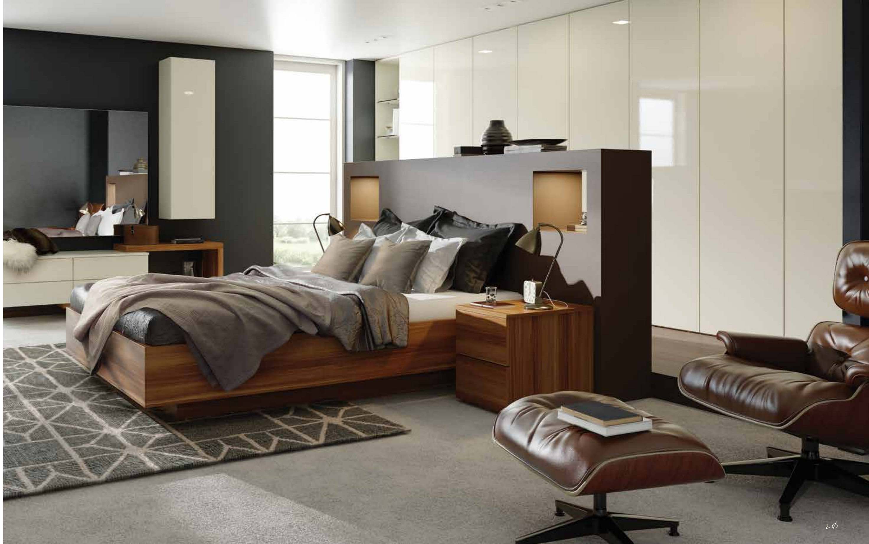
Ultra Alabaster Gloss and Autumn Plum