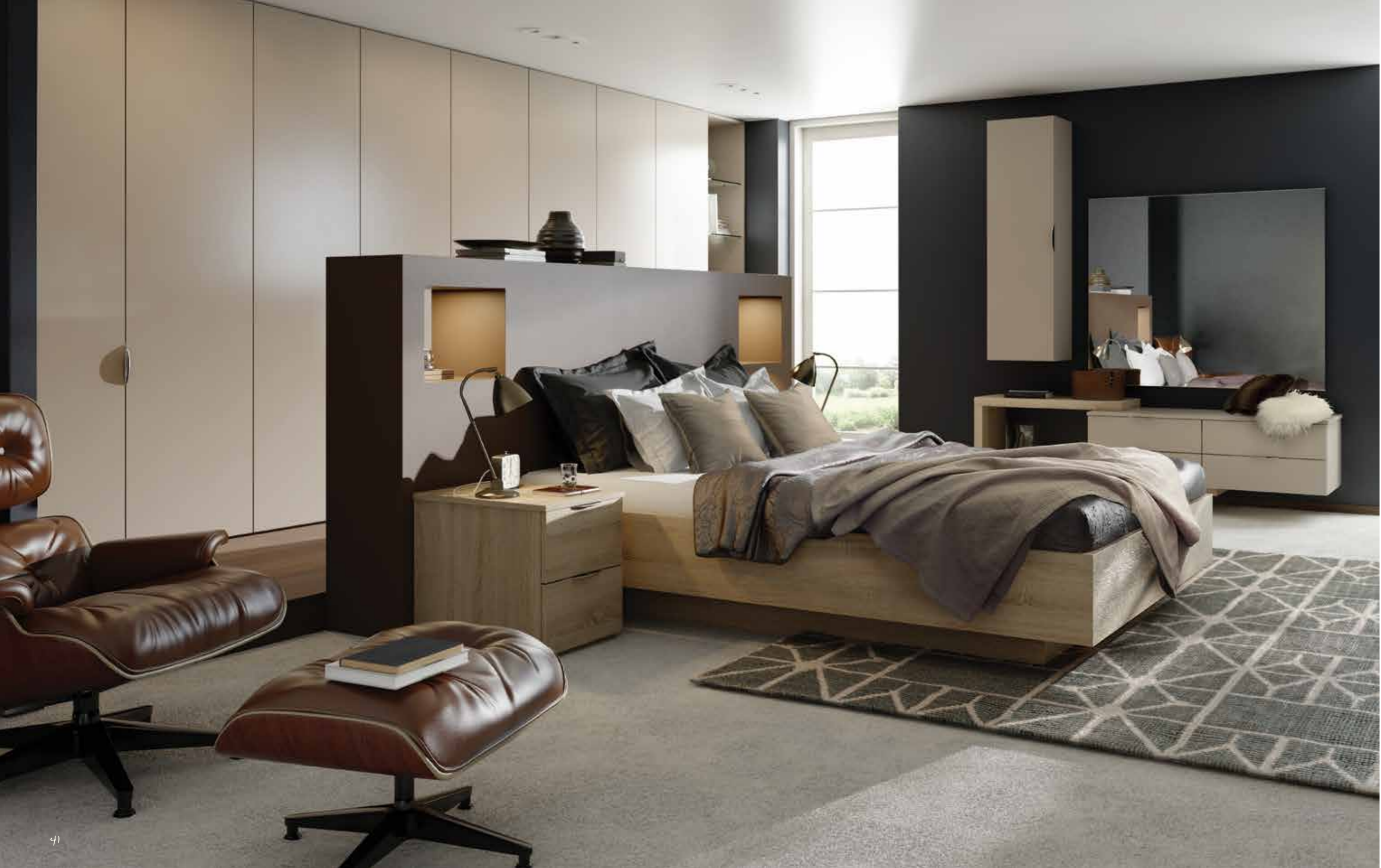
Stone and Bardolino Oak