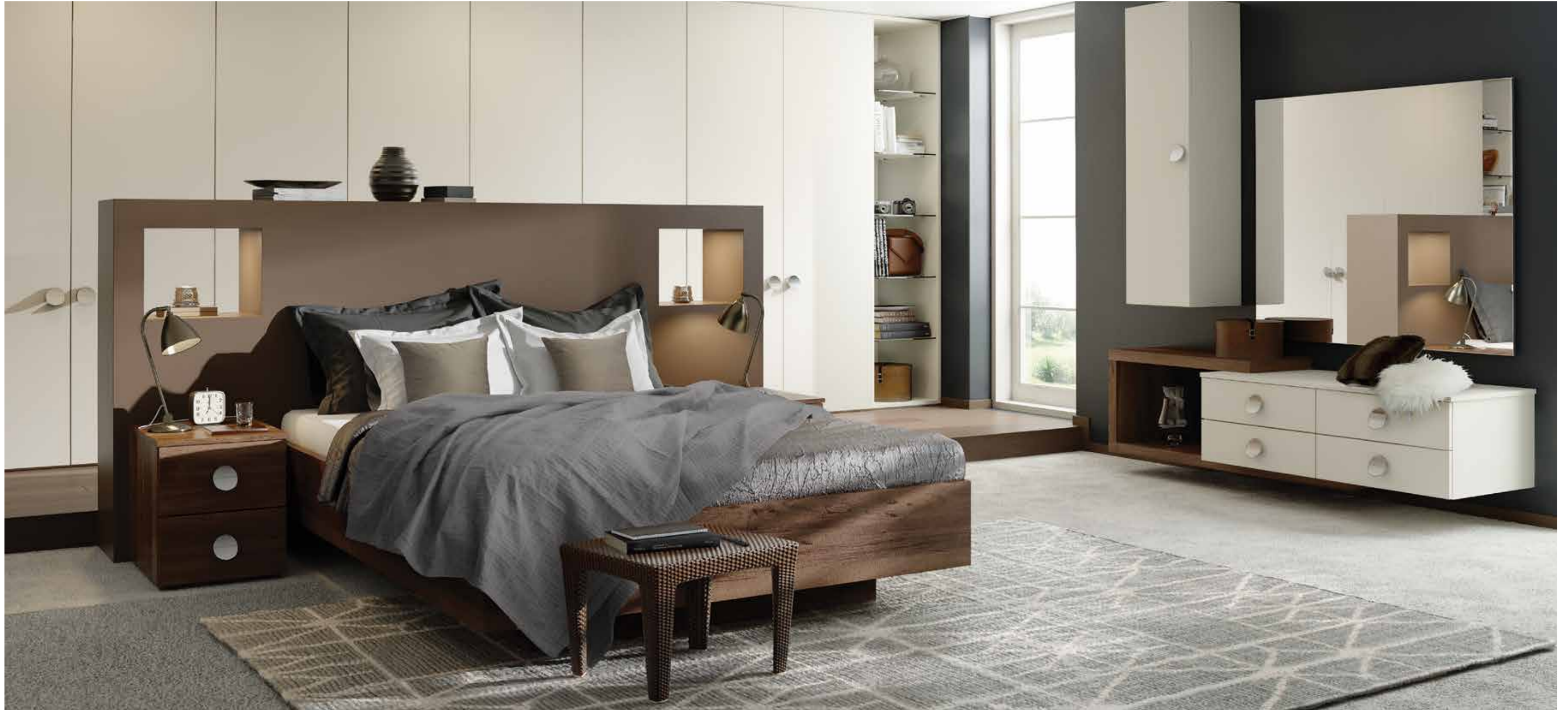
Silk and Dark Pacific Walnut